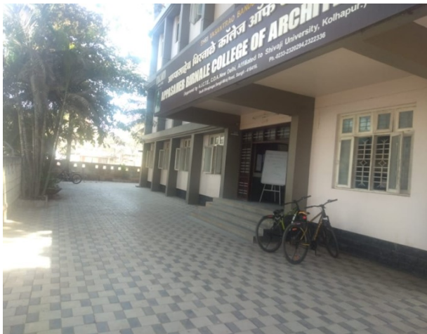
Photo: Photographic Evidence of No Vehicle Day